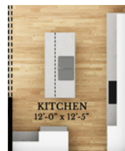
OPTIONAL BUILT-IN KITCHEN