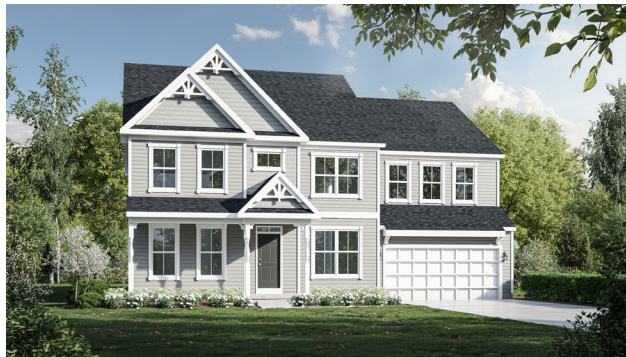
FOLK VICTORIAN Shown with optional Den & Guest Suite