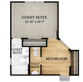
OPTIONAL GUEST SUITE WITH 3-CAR GARAGE