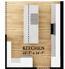
OPTIONAL BUILT-IN KITCHEN