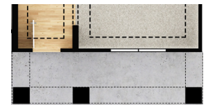
OPTIONAL CRAFTSMAN ELEVATION