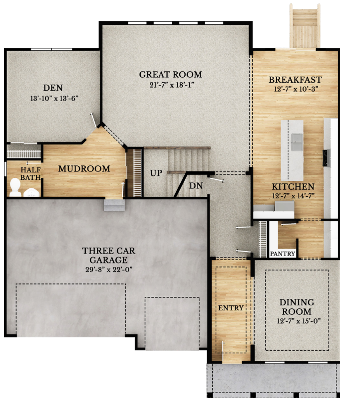
FIRST FLOOR BASE WITH 3-CAR GARAGE