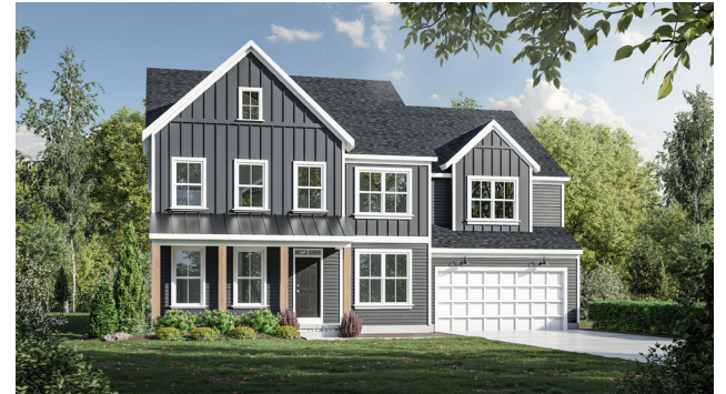
AMERICAN FARMHOUSE Shown with optional Den, Guest Suite, and optional stained porch posts