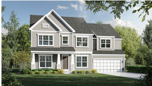
CRAFTSMAN Shown with optional Den & Guest Suite