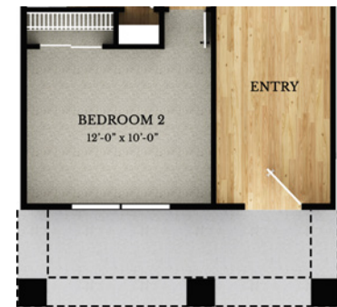
OPTIONAL CRAFTSMAN ELEVATION