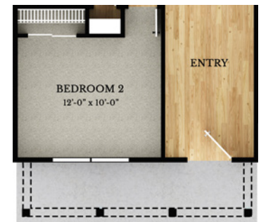
OPTIONAL AMERICAN FARMHOUSE ELEVATION