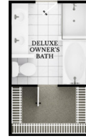
OPTIONAL DELUXE OWNER'S BATH