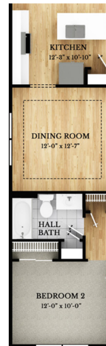
OPTIONAL DINING ROOM

1,645+ SQ. FT. • 3 BED • 2 BATH • 2-CAR GARAGE