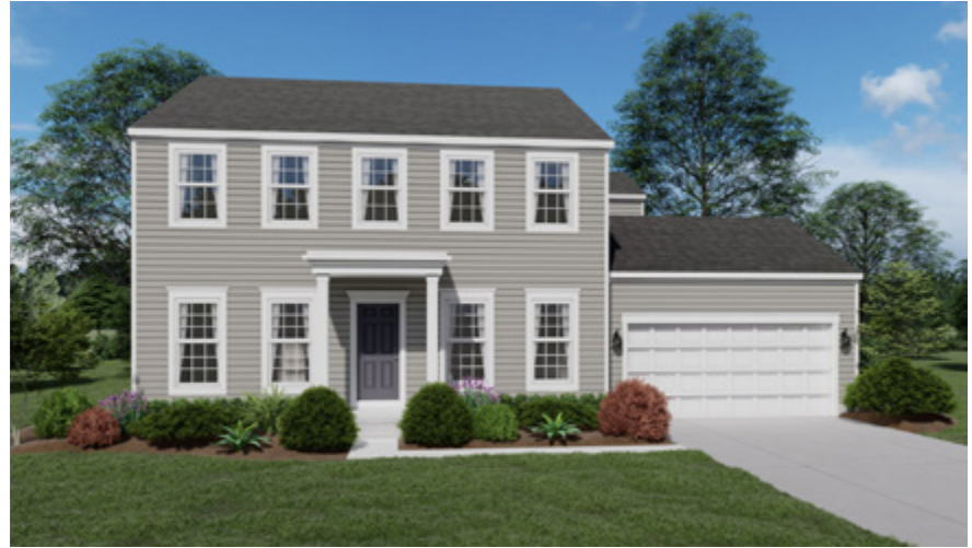
COLONIAL REVIVAL Shown with optional dimensional shingles