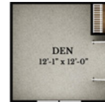
OPTIONAL DEN DOORS