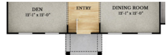
OPTIONAL COLONIAL REVIVAL ELEVATION

2,520+ SQ. FT. • 4 BED • 2.5 BATH • 2-CAR GARAGE