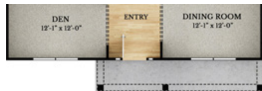
OPTIONAL SHINGLE ELEVATION