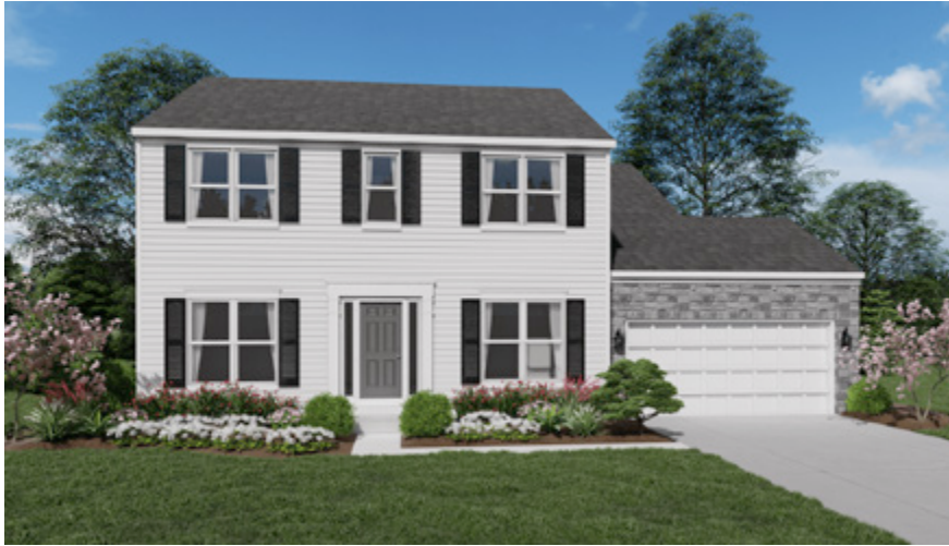
AMERICAN CLASSIC Shown with optional stone and dimensional shingles