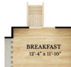
OPTIONAL BREAKFAST EXTENSION