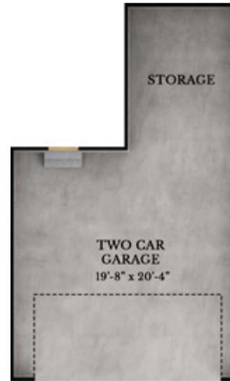
OPTIONAL TWO CAR GARAGE STORAGE